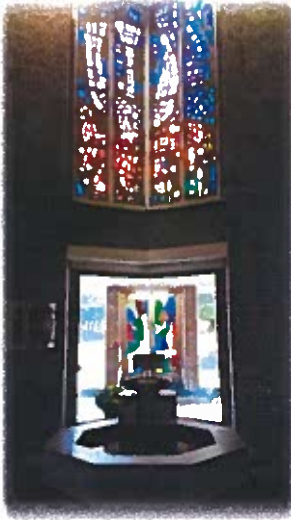
Herman H. Lohmeyer Funeral Home 500 E. Walnut Street