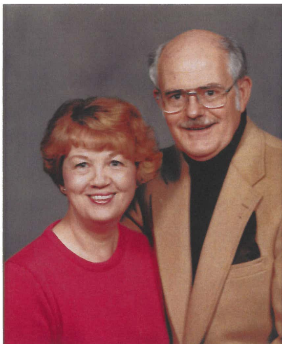
Herman H. Lohmeyer Funeral Home 500 E. Walnut Street Springfield, Missouri 65806 417-862-4433