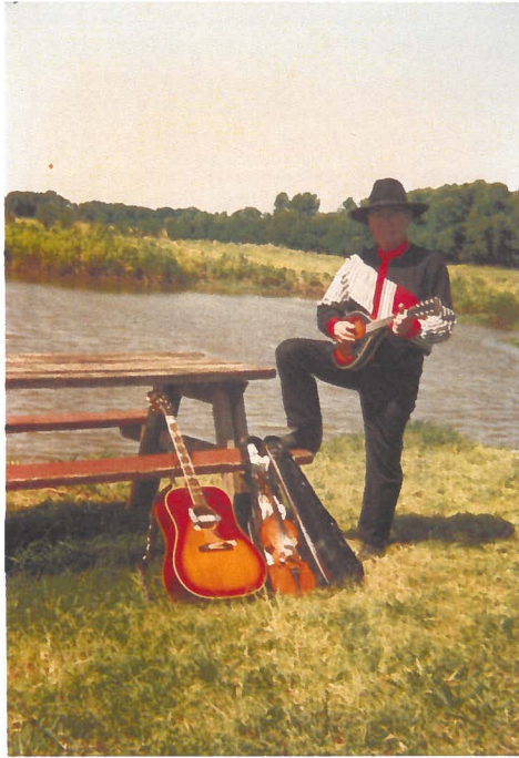
Herman H. Lohmeyer Funeral Home 500 E. Walnut Street Springfield, Missouri 65806

Permanent online condolences, stories and photos may be shared at www.hhlohmeier.com .