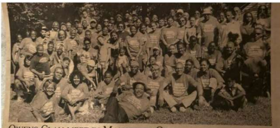
OWENS CLAN MEET IN MANSFIELD OHIO